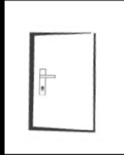
Plate Style Handle